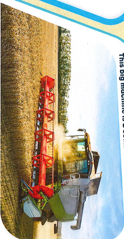
Farmers harvest crops from their fields