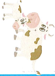
Cow and Calf