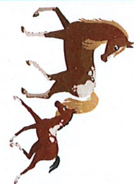
Horse and Foal