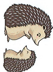
Hedgehog and Hoglet