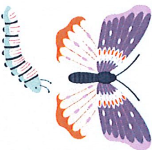
Butterfly and Caterpillar