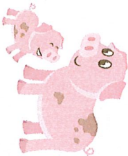
Pig and Piglet